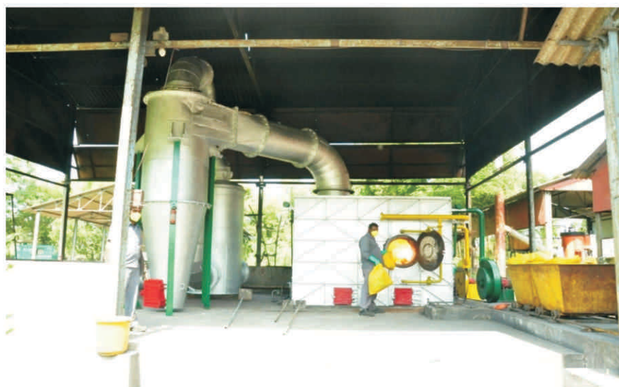
Fig.2. Common Bio Medical Treatment Facility

The unit has an incinerator of capacity of 200 Kg/hour and operating for two shifts per day (8 hours per shift) with 30 meters chimney. The chimney is connected to the Air Pollution Control devices viz. cyclone separator and wet scrubber. The stack dia is 0.60 m with volumetric flow is 1,800 m 3 /hr. The incinerator is having two chambers viz. primary and secondary chambers with 850 \pm 50 C and 1050 \pm 50 C temperature is maintained respectively. The incinerated ash is removed from the ash chamber and disposed in secured land filling area.