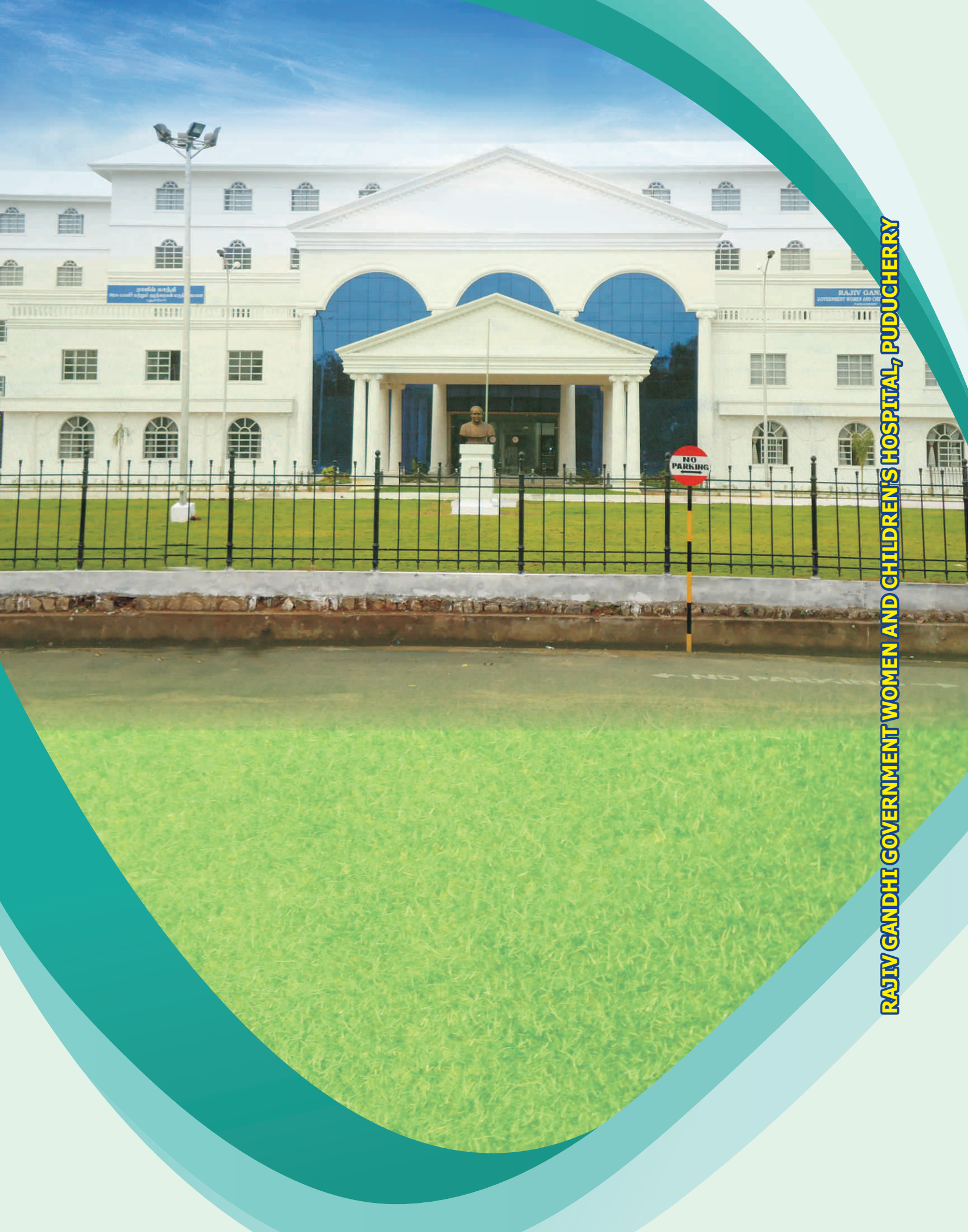
RAJIV GANDHI GOVERNMENT WOMEN AND CHILDREN'S HOSPITAL, PUDUCHERRY